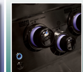
Built In Control Panel Lights