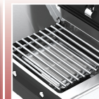
Powerful Infrared Side Burner