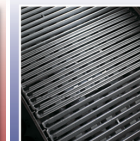
Heavy Flav-R-Cast Iron Grids