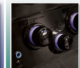
Built In Control Panel Lights