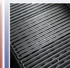
Heavy Flav-R-Cast Iron Grids