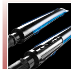
Stainless Steel Dual-Tube™ Burner System