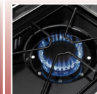
Powerful Cast Iron Side Burner